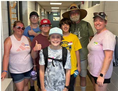
Headed out to find temporary housing