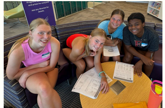
Filling out a 17 page application in the public library