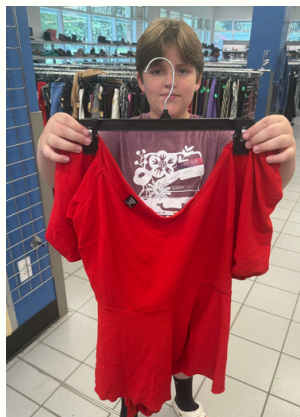
Is this a good Target interview shirt?